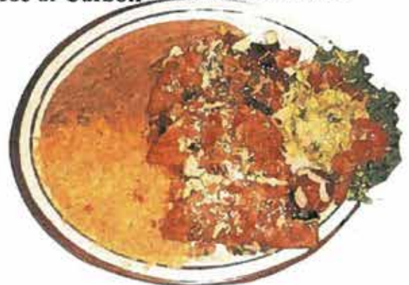
Tacos al Carbon

Three corn tortillas stuffed with your choice of cheese, chicken, ground beef or picadillo. Topped with a delicious green tomatillo sauce and melted Monterey jack cheese. Garnished with sour cream. Rice & beans.