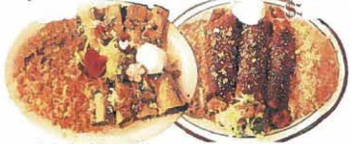
Enchiladas los Cabos

Three chicken enchiladas smothered with a blend of sour cream, parmesan cheese and just a touch of selected spices. Topped w/green onions, served w/rice and beans.