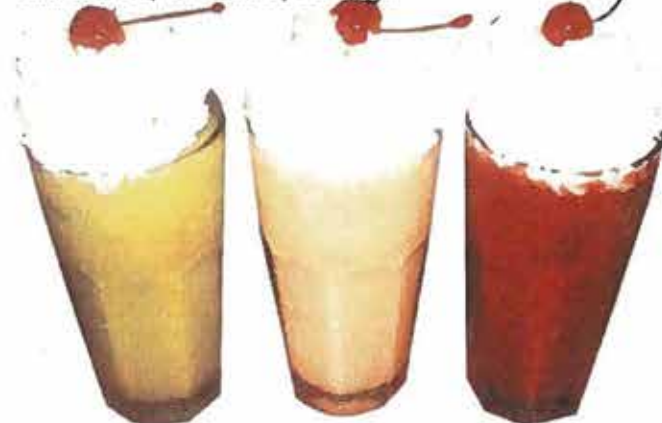
Kiwi Margarita Non Alcoholic Piña Colada