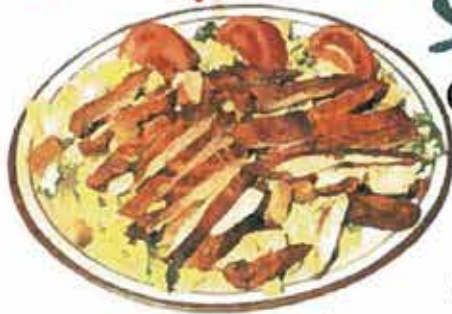
Chicken Caesar Salad